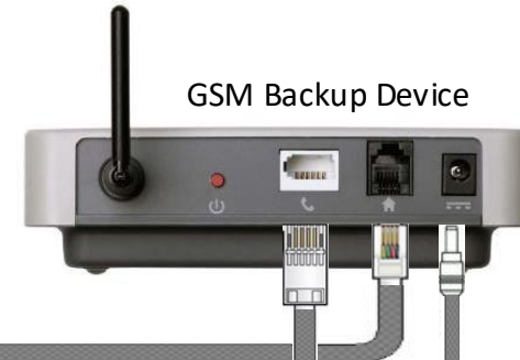
GSM Backup Device

Please note: Telephone Cable Insulation and Cores may vary in Colour, Colours used are for illustration purposes only.